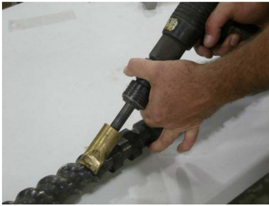
Figure 2: Air hammer with brass punch to facilitate screw removal

Preventative measures are encouraged for screw maintenance. If the screw set is left together for extended periods, it will be difficult to remove the elements. Experienced compounding firms will periodically remove the elements, clean the elements/shafts and apply anti-seize to the shafts on a periodic basis to prevent "stuck" screw elements.