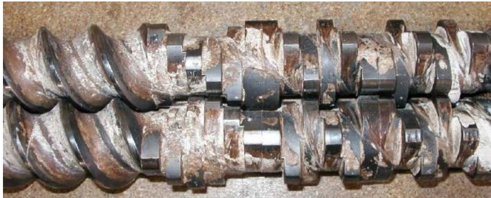
Figure 1: Screw set showing "baked on" degraded polymer

Screw elements for twin screw extruders are segmented and assembled on shafts. Sometimes getting these elements off the shafts can be problematic.