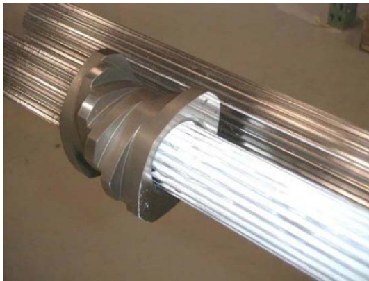
Figure 3: Anti-seize on splined shafts

Preventative measures are encouraged for screw maintenance. If the screw set is left together for extended periods, it will be difficult to remove the elements. Experienced compounding firms will periodically remove the elements, clean the elements/shafts and apply anti-seize to the shafts on a periodic basis to prevent "stuck" screw elements.