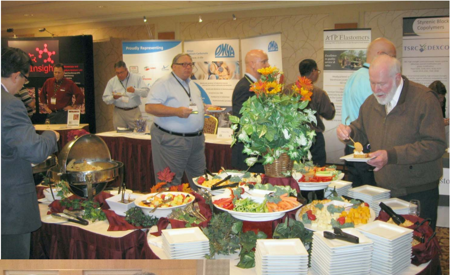
Wine and Cheese Reception