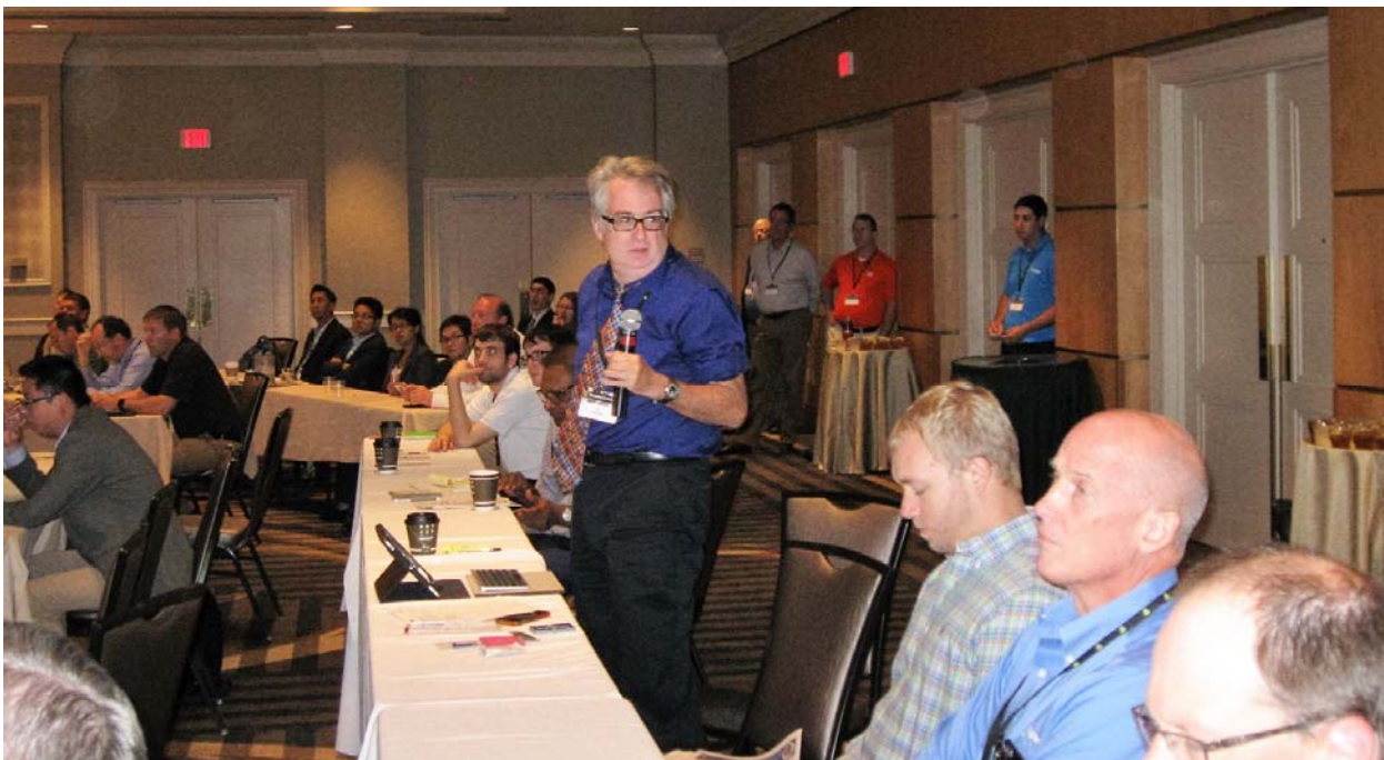
Question and Answer Time