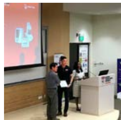
Students' posters (above-left). Appreciation certificates presented to sponsors (above-right).