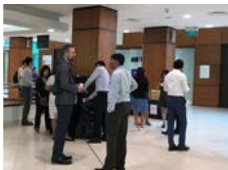
Networking sessions allowed working professionals and students to interact and exchange information (left). Presenting the best student poster award (above).