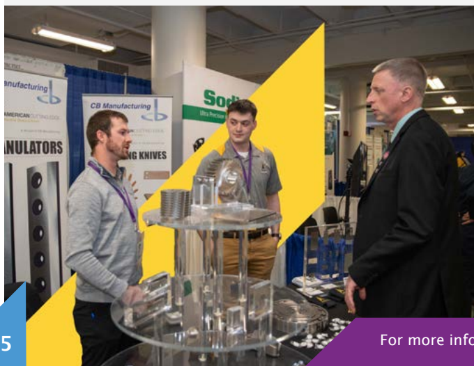
EXHIBIT SPACE FEES

Total Exhibit hours: 13 hours (7 dedicated hours)