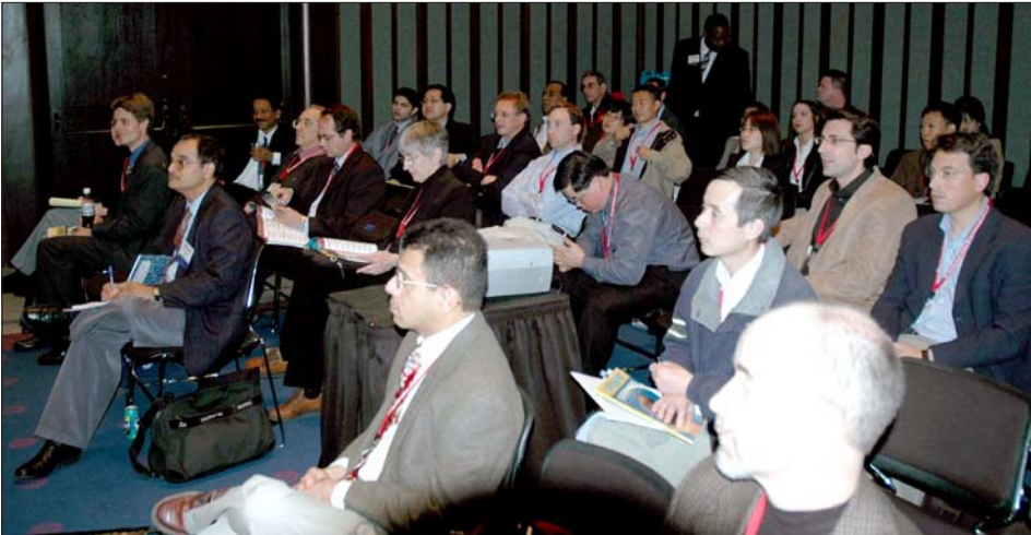
ANTEC 2005 held May in Boston was a success. More than 2,650 individuals attended the event. Exhibition sales topped those of ANTEC 2004. Many sessions were particularly well attended, including those hosted by Engineering Properties & Structure Divisions as seen in the above photo.