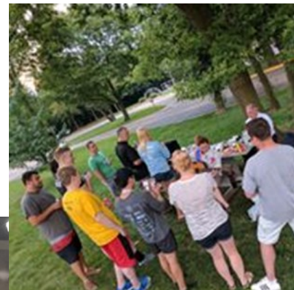
Photos below from NGAB meeting at IMTECH, NGAB Cookout & Volleyball at IMTECH, NGAB Whirlyball Social at Annual Blow Molding Conference.