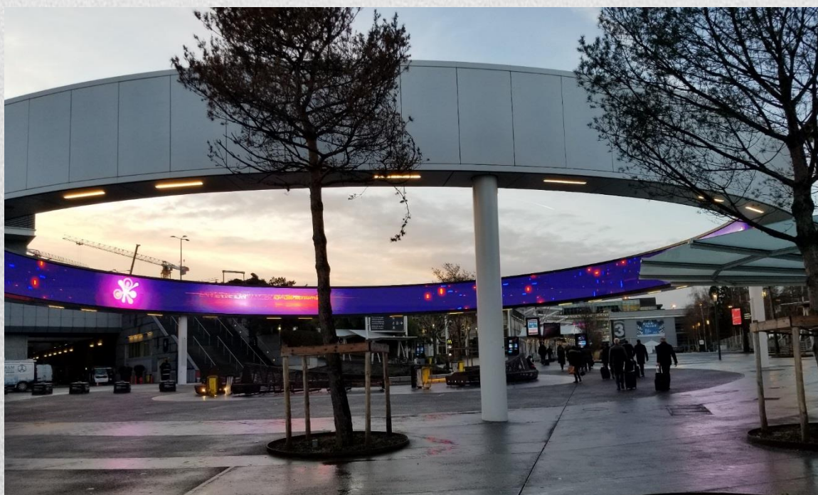
Views from the Paris convention center