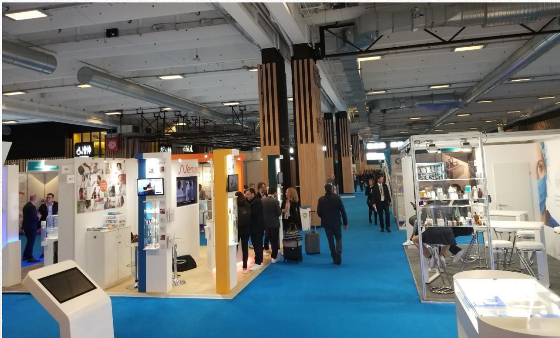
Pharmapack 2019 Exhibitors Hall