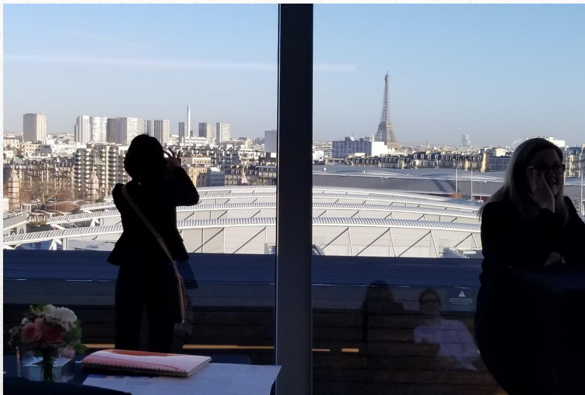
Views of the Eifel Tower from the convention center