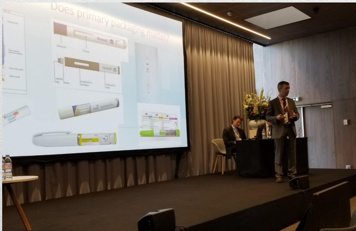
Pharmapack 2019 Technical Seminar on Primary Packaging