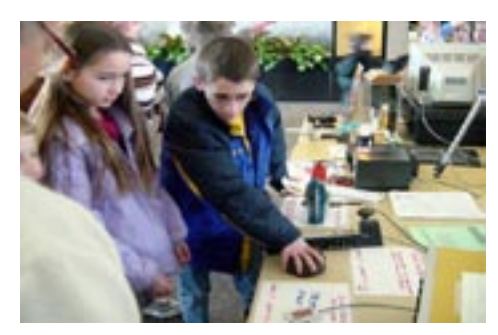
Sixty hands-on exhibits by professionals