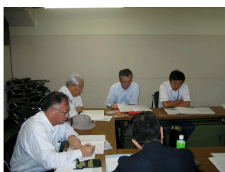
Board of Director and general meeting August, 2007

incorporation revision and the member guidelines for applicants making were approved.