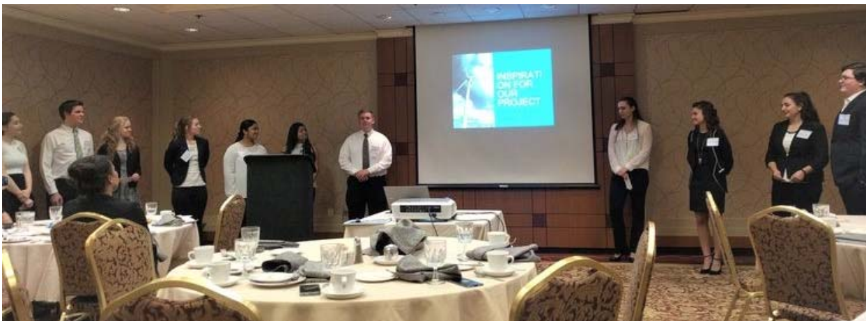
GlenOak Junior Polymer Ambassadors